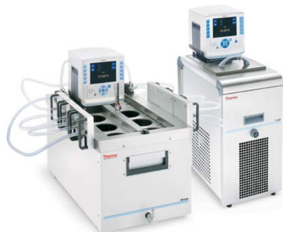
Thermo Scientific™ Horizon™ Fog Testing System configured with the PC-FTS controller, the PC200-A25, and the reflectometric accessory kit

With our extensive global footprint service and support is just a click or phone call away.