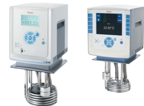
Robust pump design for uniform sample temperatures

Notes: Refer to the ordering information for the part #. Heat transfer fluid oil and D1DP is sold separately. All accessories can be purchased separately.