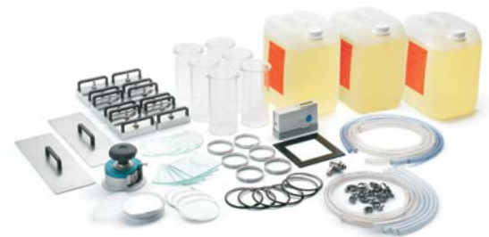
Horizon FTS Accessories