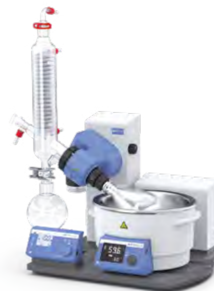
RV 10 digital V-C