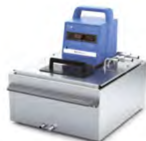
ICC basic pro 12 c