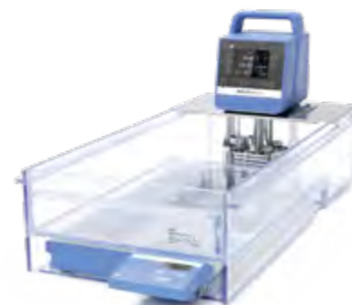
ICC control IB R RO 15 eco

* Bath bridge, cover, pump connection set and cooling coil are included in delivery