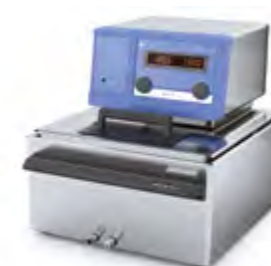
ICC control pro 9