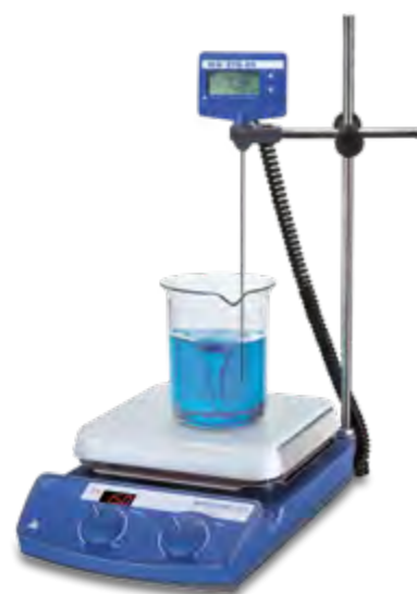
C-MAG HS 7 Package