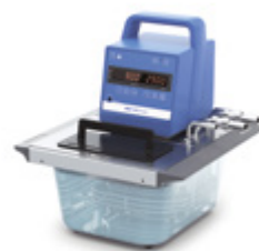
ICC basic eco 8 c