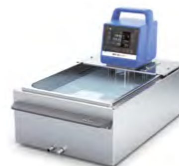
ICC control pro 20