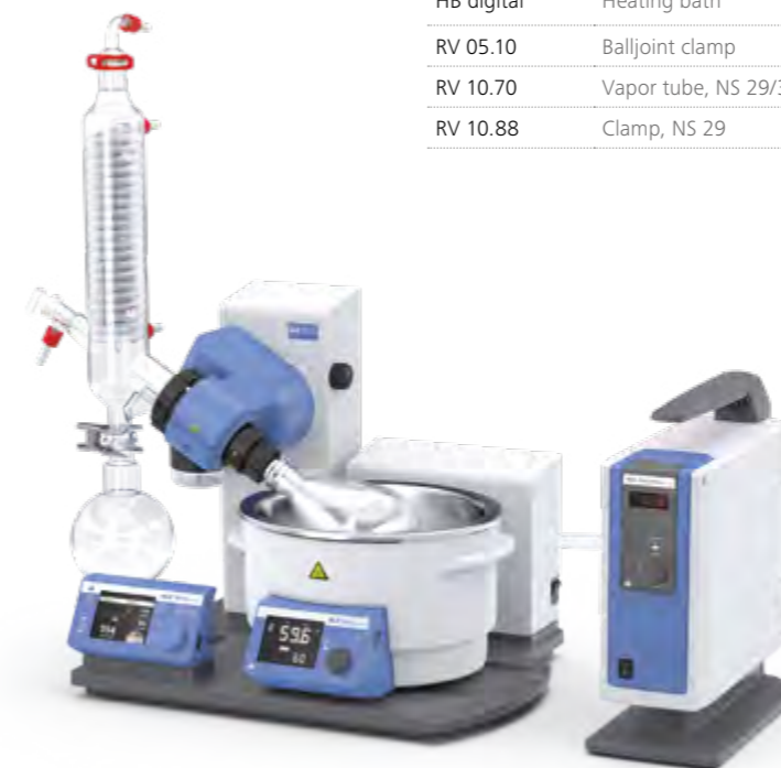
RV 10 auto pro V-C