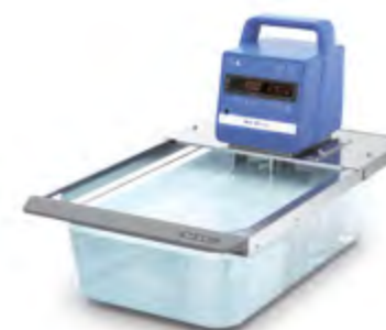
ICC basic eco 18