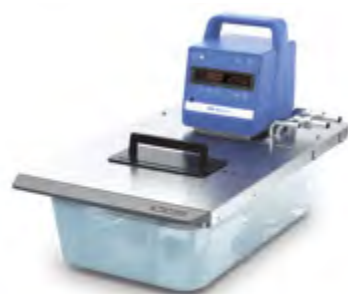
ICC basic eco 8 c