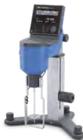
ROTAVISC me-vi Complete

* ROTAVISC packages include: SP 1-4 (lo-vi) / SP 7-12 (me-vi, hi-vi I, hi-vi II), protective bracket, temperature sensor, quick connector, hook connector, ROTASTAND stand