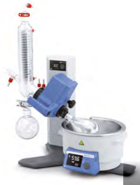
RV 8 V-C