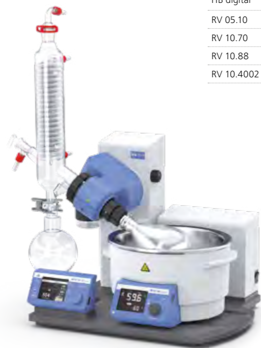
RV 10 auto V-C