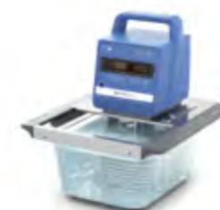
ICC basic eco 8