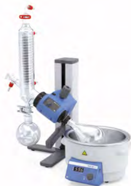
RV 3 V-C