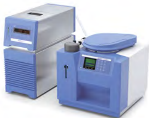
C 200 auto