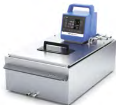
ICC basic eco 8 c