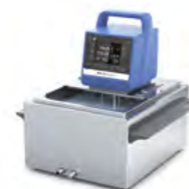
ICC control pro 9