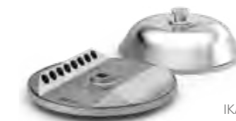
IKA G-L, PCR Set