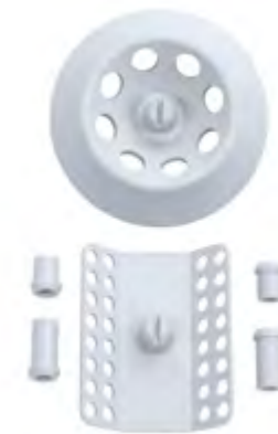
*Adapters included in delivery

IKA G-L EUR 999,00 Ident. No. 0030000774